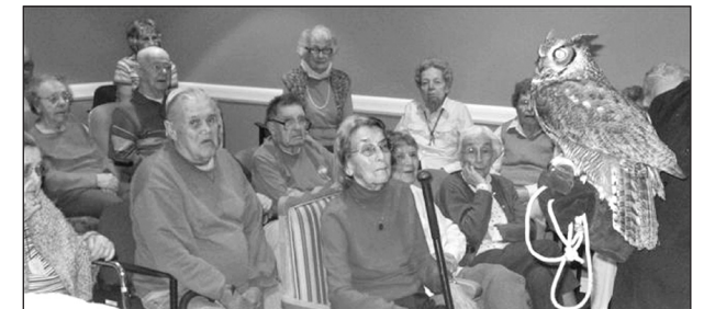
Residents enjoyed a Chewonki Foundation program on owls sponsored by the SFSS Board of Managers.