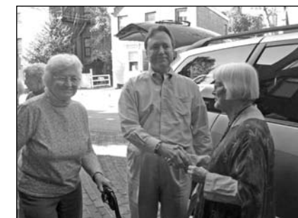
Thank you, thank you!